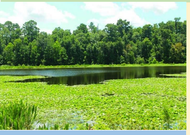
About Green Belt

Green Belt Programme is started in the college in 2021 with an aim to promote conservation of environment, sustainable development and protection of biodiversity of the college campus. The prime objective is plantation which serves as 'Green Lungs' to minimize the pollution in the heart of the city.